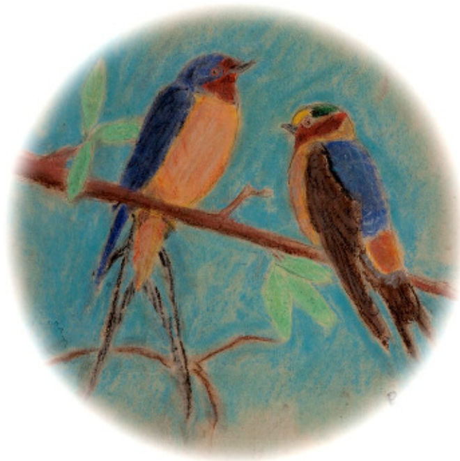
Paul Ilian — Blue Birds