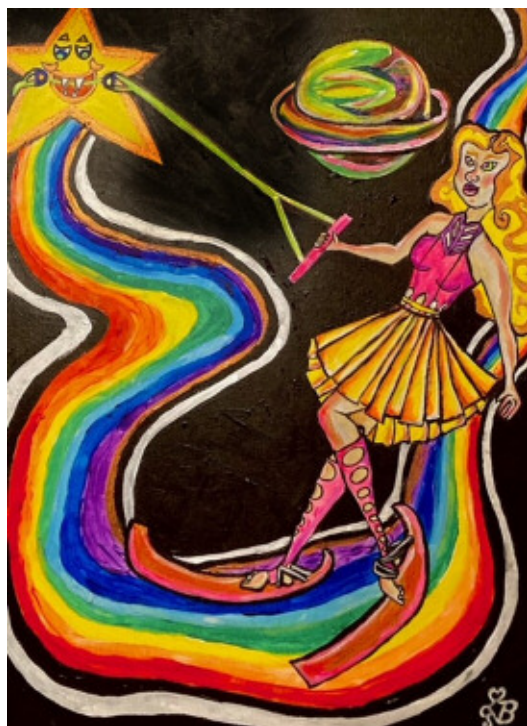
Rachel Baker — Star Skiing