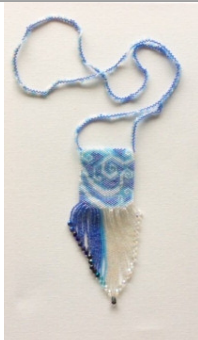
Patricia Layden – Wind, beaded amulet pouch