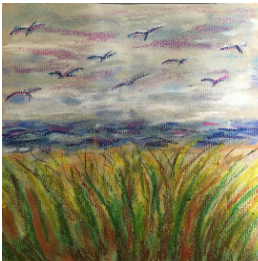
Debry Valpey — At the Sea, pastels