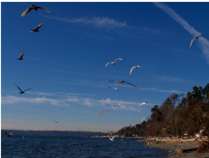
Chris Gonvers, Birds in the Wind, digital photograph