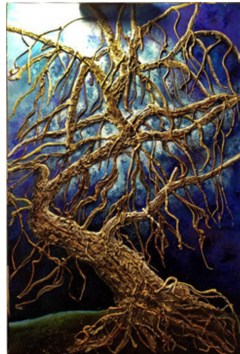
Myong Sweet – End of Life, mixed media on canvas