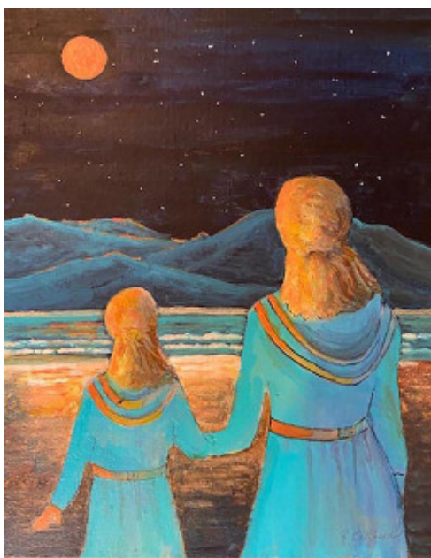
Judy Eckhardt -- Night Sky — acrylic