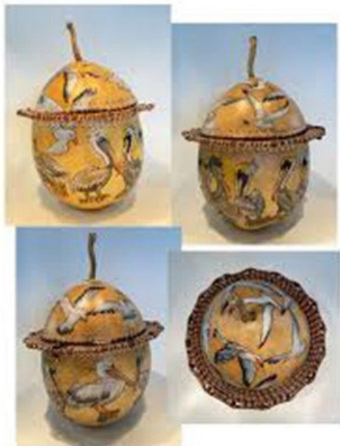
One of Gretchen's Gourds