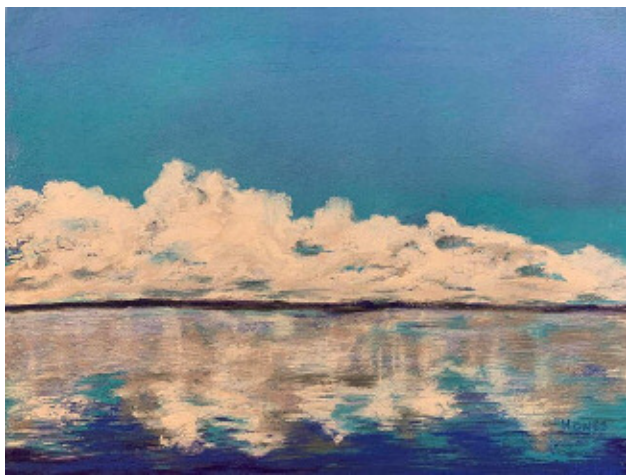
Louise Hones -- Reflections