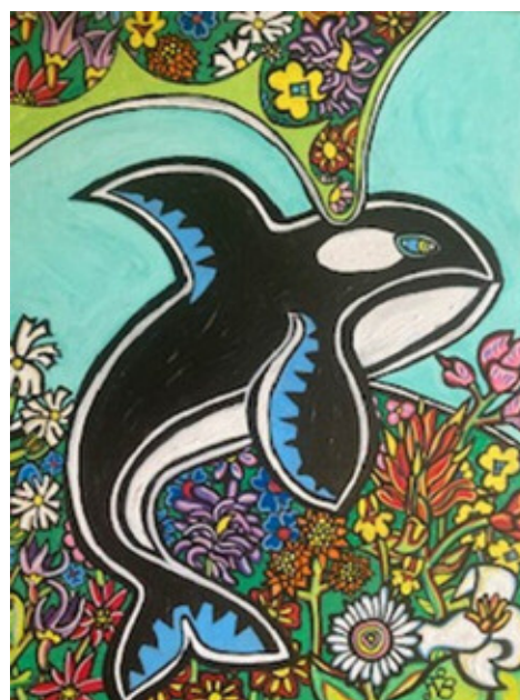
Rachel Baker — Flowerspout