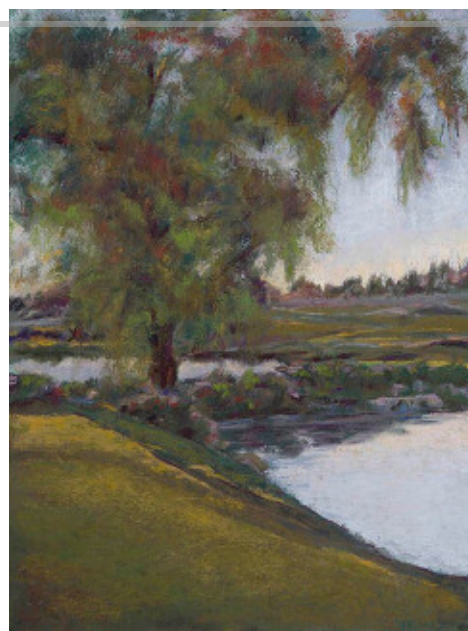
Louis Hones -- Quiet Time