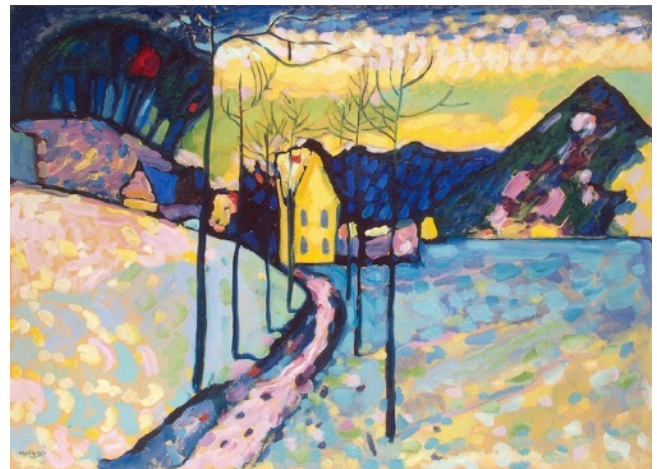
Wassily Kandinsky, Winter Landscape, 1909

Since there was no AU artwork of the month, here is a wonderful snowy, winter landscape, full of color!