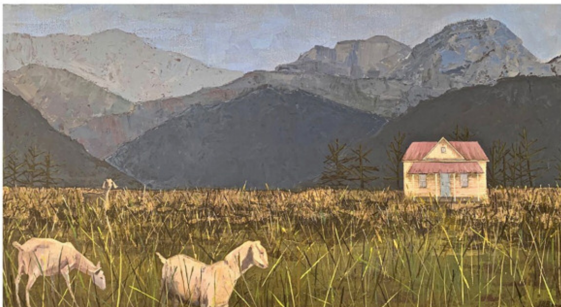
"Seeing is Believing", painting 20"x30" ©2019, Sara Brogdon