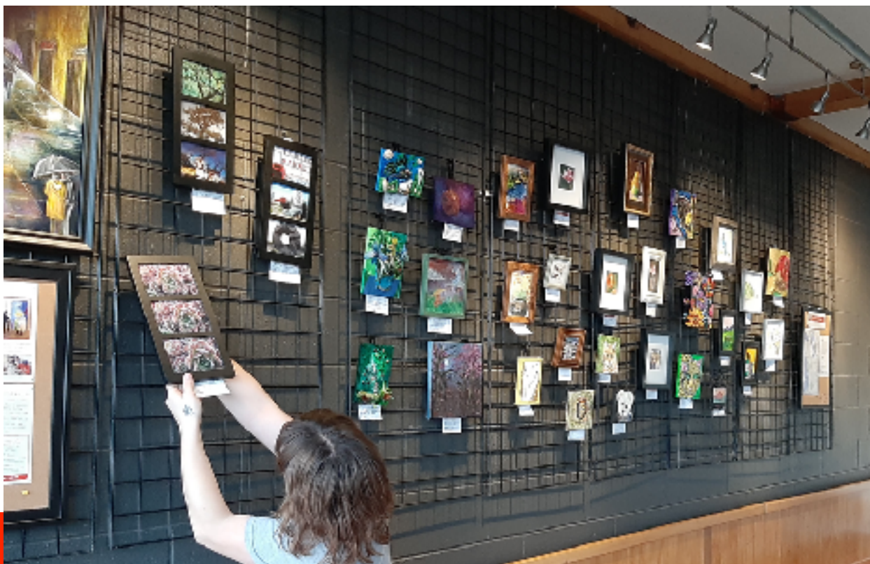
New display at Grand Central Bakery

Grand Central Bakery show continues after the Cove Show. The Bakery manager and staff are most enthusiastic about AU presence. Our President is checking to see if the bakery will host a reception on December 1 to coincide with First Friday Art Walk. Please keep artworks for sale for under $100.